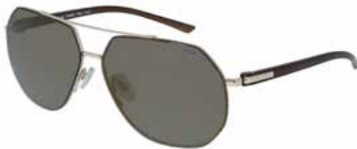
P1003C Gold/Brown, Mirror Gold on Smoke