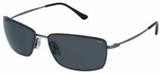
P1009B Gun, Solid Anthracite