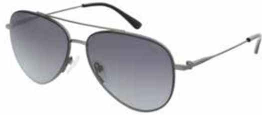
JUNGFRAU P1104C Satin Grey, Gradient Grey