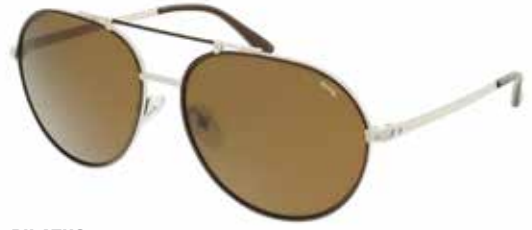
PILATUS P1106B Gold, Solid Brown