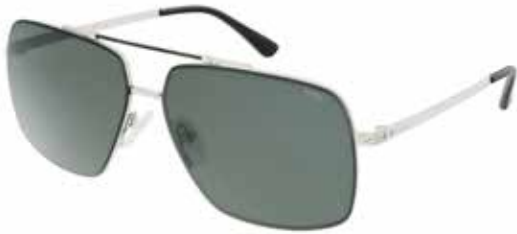
TITLIS P1107A Black/Silver, Solid Jet