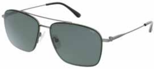
MATTERHORN P1103A Satin Gun, Solid Jet