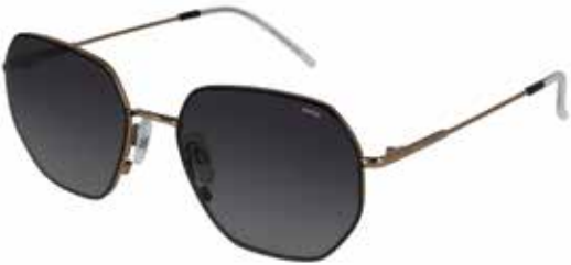
P1007C Bronze Gold, Gradient Charcoal