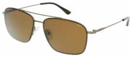
MATTERHORN P1103B Satin Brown, Solid Brown