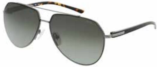
EIGER P1105C Gun/Satin Demi, Gradient Green