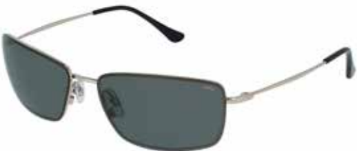
P1009C Gold, Solid Green