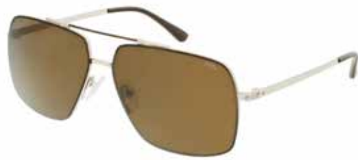
TITLIS P1107B Brown/Gold, Solid Brown