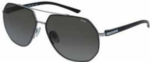
P1003B Gun/Black, Gradient Green