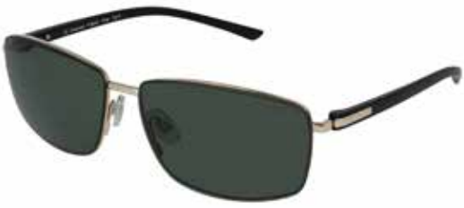
P1004C Gold/Black, Solid Green