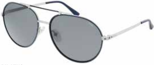
PILATUS P1106A Navy/Silver, Solid Grey