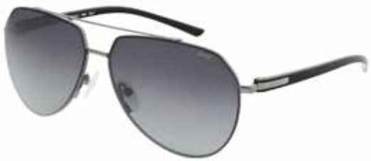
EIGER P1105A Gun/Satin Black, Gradient Grey