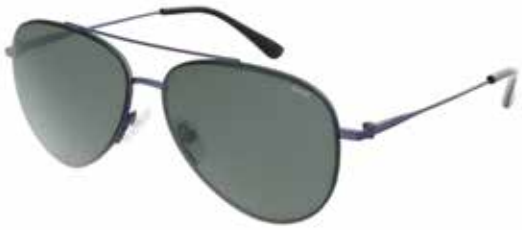
JUNGFRAU P1104A Satin Navy, Solid Jet