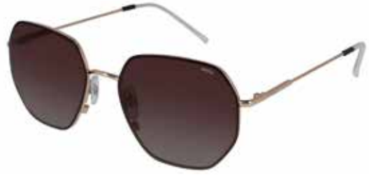
P1007B Rose Gold, Gradient Cassis